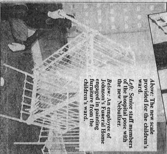
Below: An employee of Johnson's Funeral Home engaged in painting furniture from the children's ward.